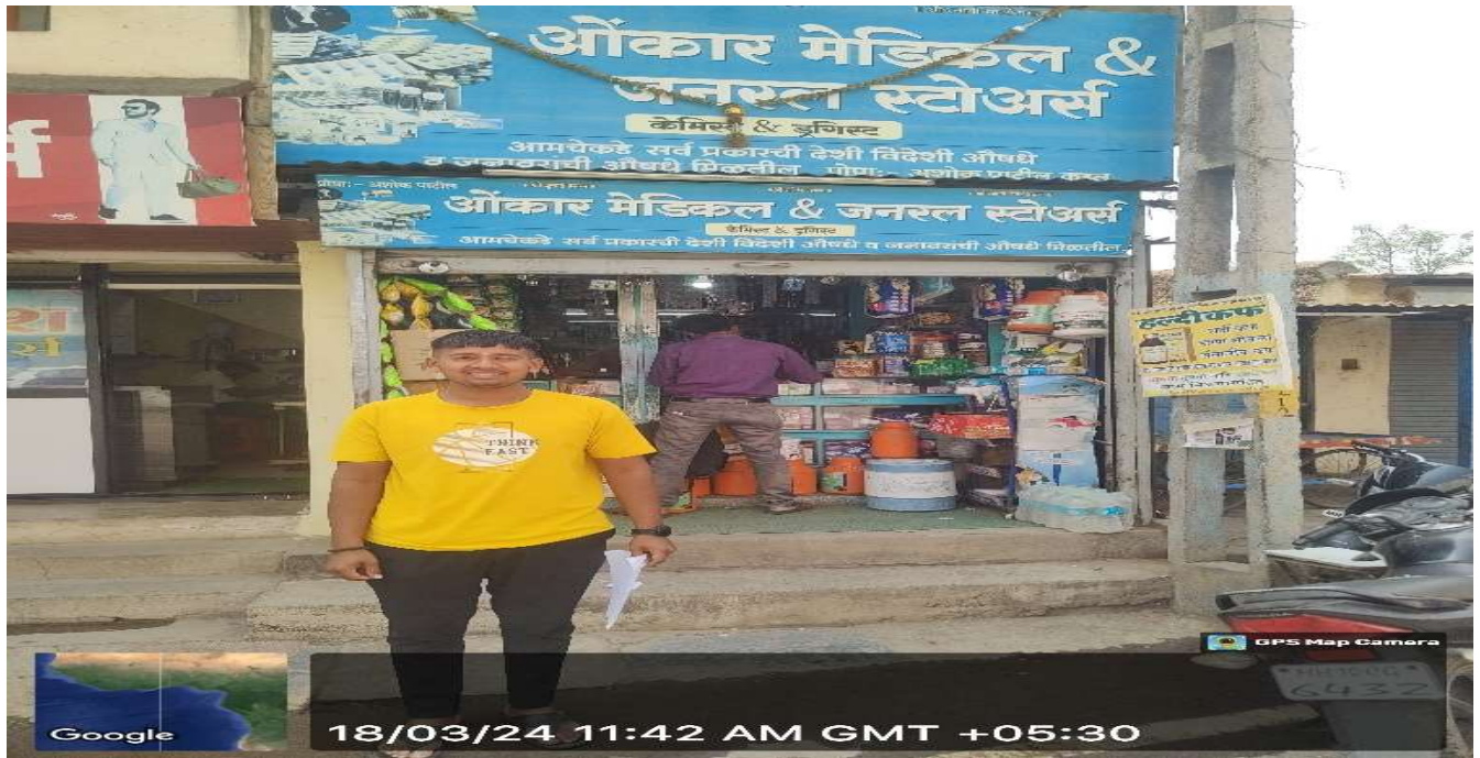
Market Survey Done by Students